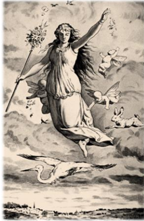
Eastre or Eostre

perpetuated the former error. 5 Wycliffe's translation of 1395 correctly translates the Greek as Passover , however, the subsequent translations done by William Tyndale (1525) and Miles Coverdale (1535) both used the term Easter . Why Tyndale would have done so is somewhat mystifying, as it is said that he translated directly from the original languages. 6 Coverdale, on the other hand, depended largely on Tyndale's work, as he did not have the same grasp of the languages.